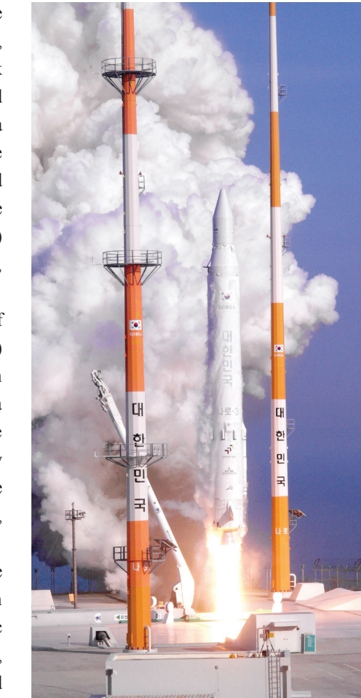
Launching of Naro

Since the 1990s there have been extensive research efforts concerning space in Korea. To date, seven science and technology satellites, four multi-purpose satellites, and one geostationary satellite have been launched. Eleven satellites, including five satellites that are currently under development, will be launched by 2020. Three scientific rockets have been launched to gain launch capability. A space center was constructed on Narodo in Goheung-gun, Jeollanam-do in 2009. A KSLV-1 (Naro) rocket equipped with a 100 kg-class satellite was successfully launched in 2013. An engine test for the development of the second KSLV was successfully conducted in 2018. Launch of a vehicle that can carry a 1,500 kg-class satellite, KSLV-2 (Nuri) is planned for 2021.