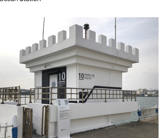
Surface Currents Station

The Korea Ocean Observing Network (KOON) combines instruments and infrastructure to effectively manage and monitor oceanic conditions within Korea's sovereign marine areas. It consists of tidal stations, ocean stations, ocean buoys, surface currents stations, and ocean research stations. Oceanic data collected through the network include tidal height, water temperature, salinity, wind speed, wind direction, current direction, current speed, and wave height. The collection and analysis of ocean data have enhanced the understanding of Korea's sovereign sea areas and have improved the national capability for marine utilization, development, preservation, and climate change and disaster mitigation efforts. The construction and operation of the KOON also have been associated with the building of the ocean surveillance infrastructure for increasing the capability of the maritime defense force. These datasets are disseminated through the Korea Ocean Observing and Forecasting System (KOOFS) website. The results of scientific analyses based on the data are compiled into newsletters, yearly white papers, and abnormality reports, which are then released to 200 relevant authorities.