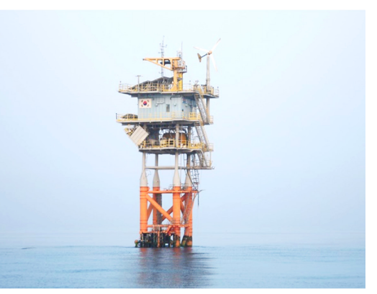
Shinan Gageocho Ocean Research Station

Structures for Ongjin Socheongcho Ocean Research Station were manufactured and installed by the Korea Institute of Ocean Science & Technology (KIOST) from 2011 to 2014. With the pilot operation conducted from 2014 through 2015, the entire facility was transferred to Ongjin Socheongcho Ocean Research Center on January 1st, 2016. The floor area of the station is 2,700 m<sup>2</sup>, and the full height from its underwater base is 90 m. The Socheongcho station is located 37 km south of Korea's Socheong-do Island and is