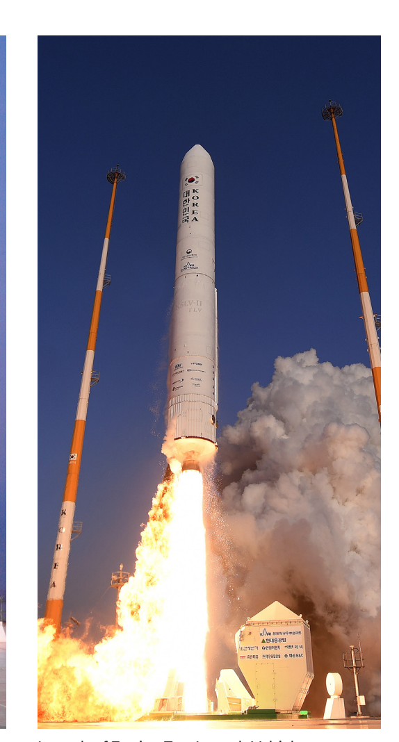
Launch of Engine Test Launch Vehicle for Nuri KSLV-2